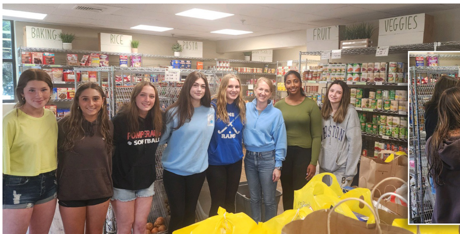
Confirmation Students at the Southbury Food Bank