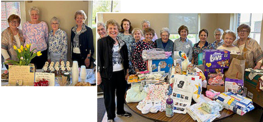
L.I.F.T. hosted a baby Shower for Carolyn's Place.

Catholic Communication Campaign Today we take up the collection for the Catholic Communications Campaign (CCC). Your support helps the CCC connect Catholics with Christ in the United States and around the world using the internet, television, radio and print media. Half the funds we collect remain here in our Archdiocese to support our local efforts. Be a part of the campaign to spread the gospel message. Support the collection today! Learn more at www.usccb.org/cc .