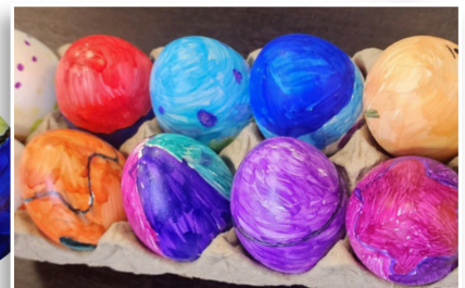
Confirmation students shine through creating Easter egg baskets for skilled care facilities