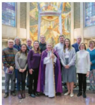
OCIA Group photo at Rite of Election

The grace of the night is for all of us.