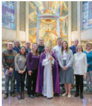
OCIA Group photo at Rite of Election